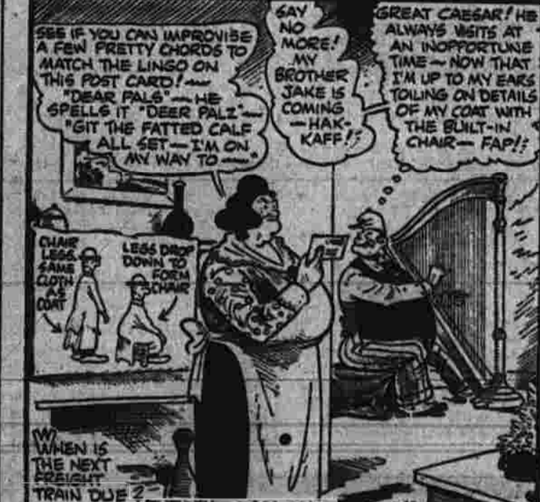
with MAJOR HOOPLE