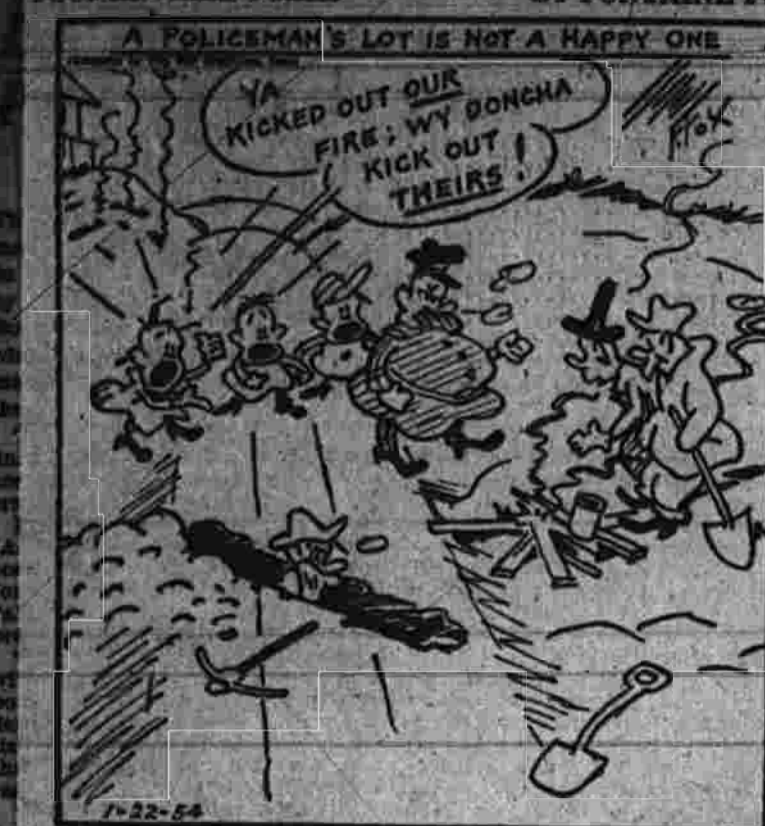
BY FONTAINE FOX