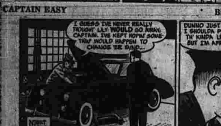
Back We Go