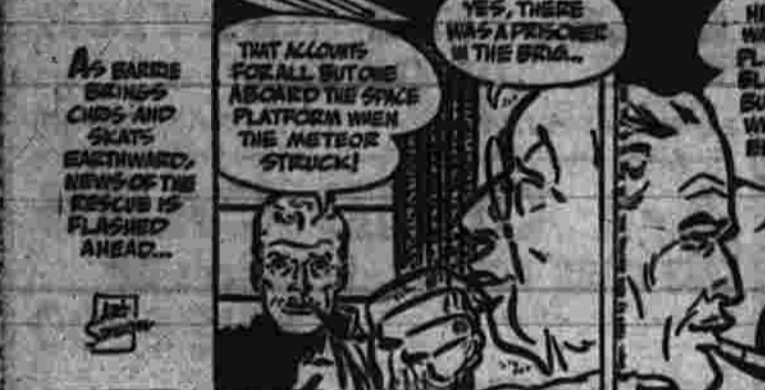
BY RUSS WINTERBOTHAM